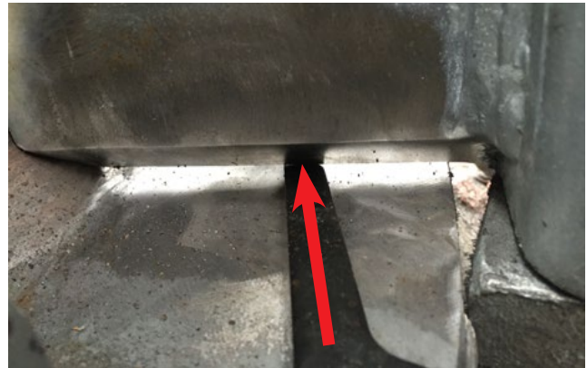
Root Gap to Base Plate Below Anchor Rod Bracket

fied joint parameters. In other words, if the root gap between parts is too large, then it will be outside what is permitted by the code for a prequalified joint and a qualification will be required for the weld. Poor fit-up almost always causes weld quality issues and discontinuities as previously discussed.