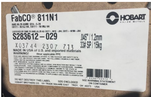
FCAW E81T1 Wire

A welding consumable typically refers to the electrode providing the filler material for the welded joint. Typical stick electrodes (shielded metal arc welding – SMAW) are E7018 or E8018. Typical wire electrodes (flux-cored arc welding – FCAW) are E71T or E81T. The basic difference is the strength of the stick electrode or wire. While the choice of SMAW versus FCAW is entirely up to the welder, the CWI will confirm what filler metal strength is being used against the project requirements and what is required by the Code.